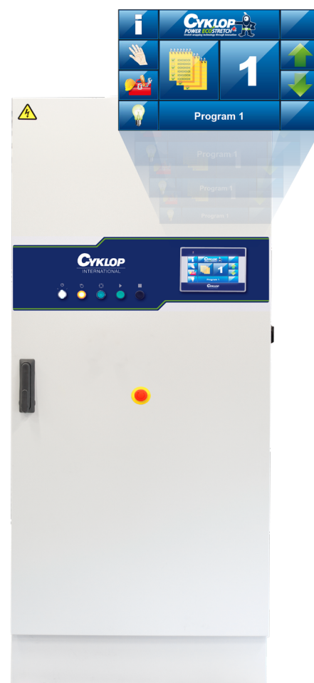
All program parameters and settings can easily be adjusted in the color touch display.